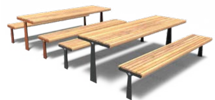
GRO 2300 COMBINATION