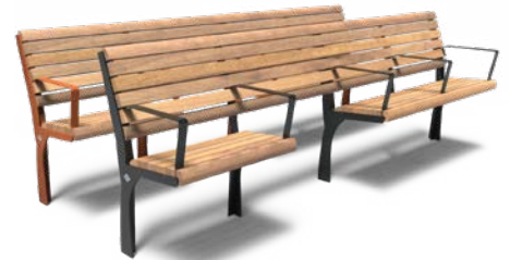
GRO 2600 SENIORS