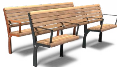
GRO 2000 SENIORS