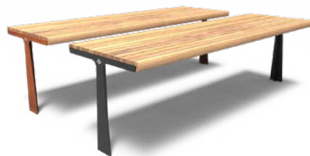
GRO 2300 TABLE