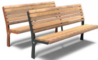
GRO 1500 WITH BACKREST