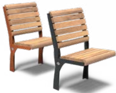
GRO 500 WITH BACKREST

For a complete overview of all our products and specifications, please visit www.furns.com .