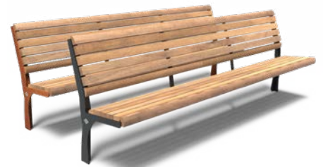
GRO 2300 WITH BACKREST